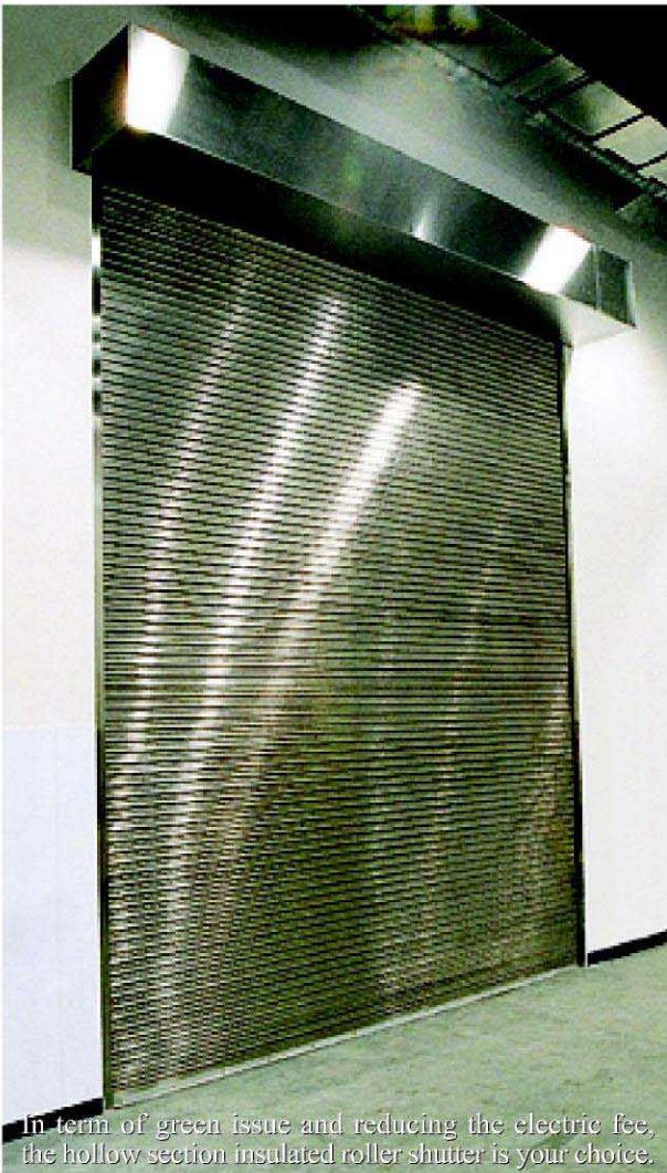
In term of green issue and reducing the electric fee, the hollow section insulated roller shutter is your choice.