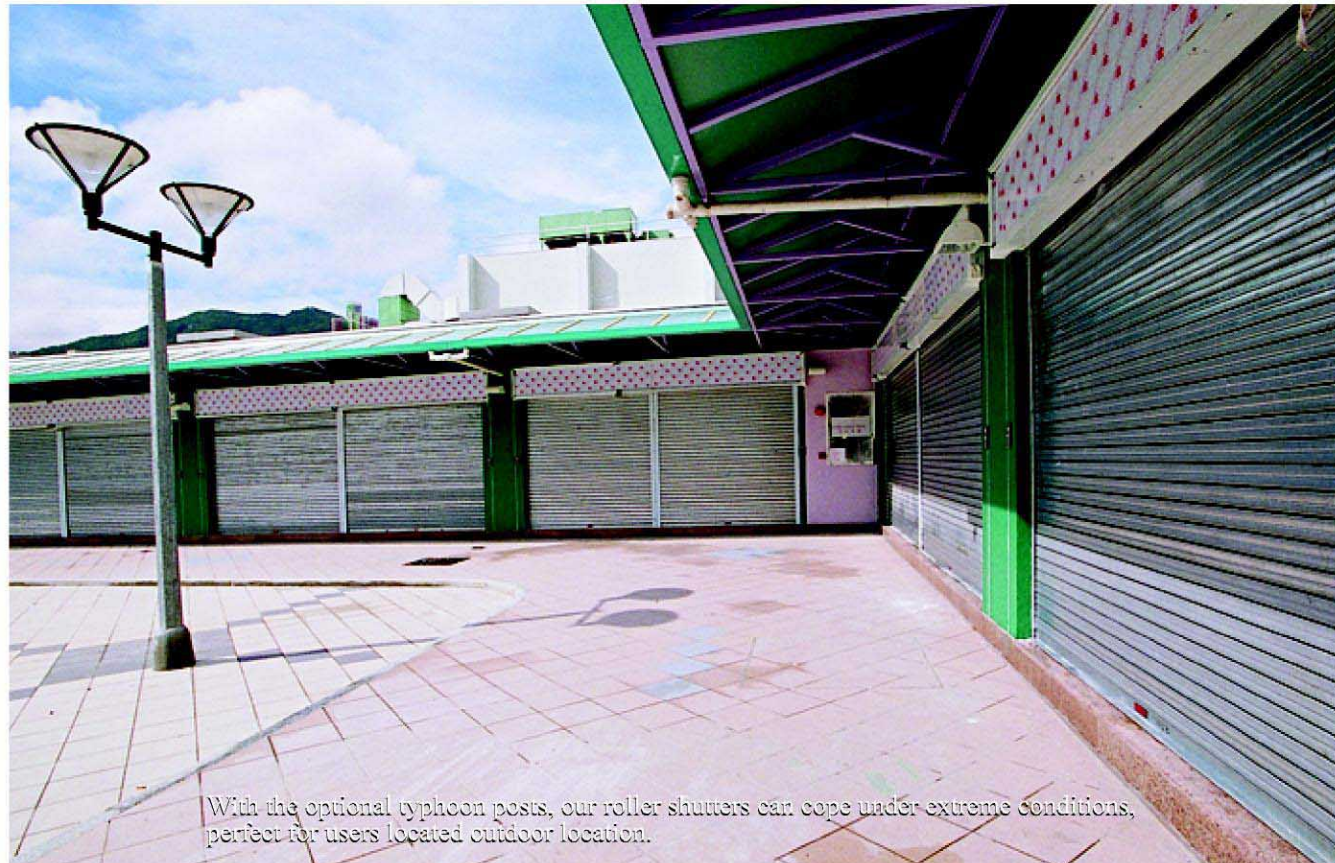
With the optional typhoon posts, our roller shutters can cope under extreme conditions, perfect for users located outdoor location.