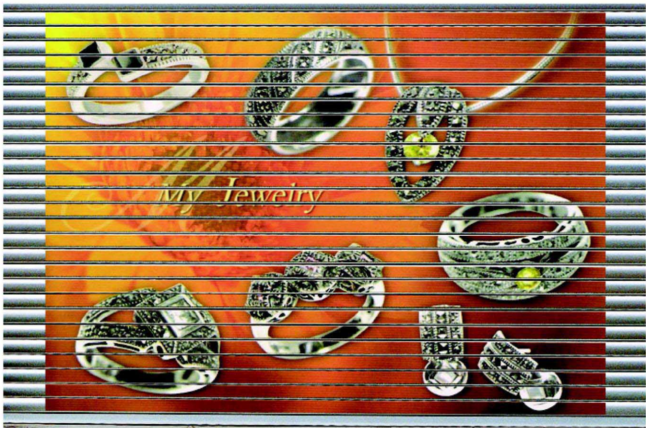
Inkjet print advertisement can be added on our Shutter Curtain, hence making up a large outdoor advertisement board.